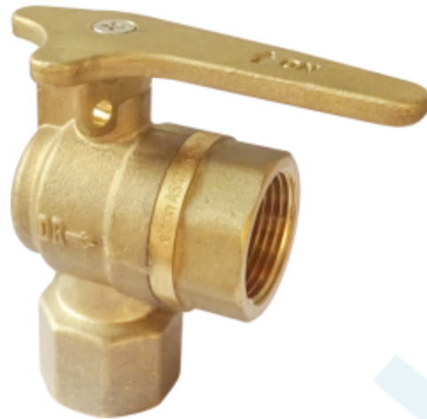
Product Code 74136