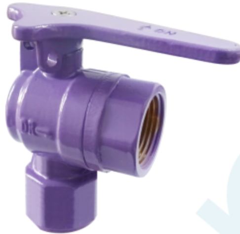
Product Code 74236